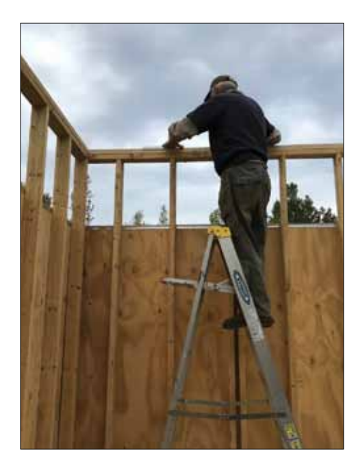
New OLT storage garage in progress