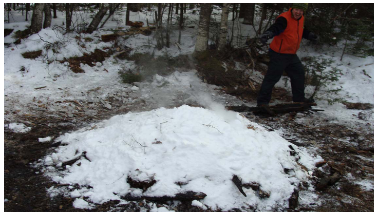
and many hours later