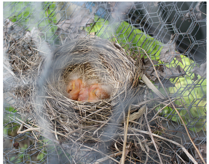
Photo captions: (a) Robin nest in roll of wire, (b) three eggs in nest, and (c) three newly hatched young in nest.