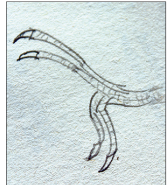
Fig. 3 Sketch of zygodactyle foot by JRL