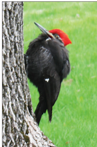
Fig. 2 Visible red chin stripe of male.