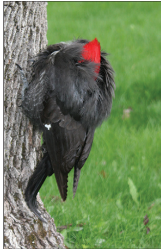
Fig. 1 Sleeping Pileated Woodpecker