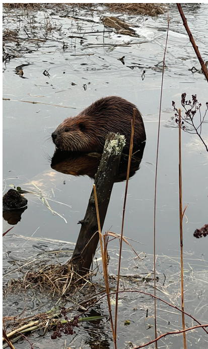
Text and photo by Gail White

This adorable beaver with exceptional engineering skills is so fun to see. They are prolific on the Caribou Bog Conservation Area (CBCA) waterways. Unfortunately, there exists an ongoing battle between the OLT volunteers and the beavers. Beavers flood the trails and volunteers put in "beaver deceivers," which are the wire devices seen along the culverts on the Veazie Railroad Trail. Which party is being deceived?